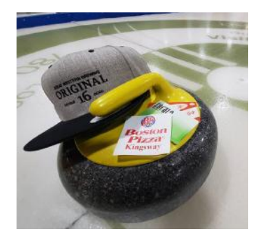
Our Sunday Doubles played Skin Doubles with prizes from Cobs Bread Brewery District, Zocalo, Boston Pizza Kingsway, and Original 16.