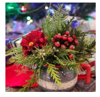
Festive cheer got a whole lot greener with these table toppers provided by Zocalo.

The NAIT Nugget learned how to curl at their annual Christmas party.